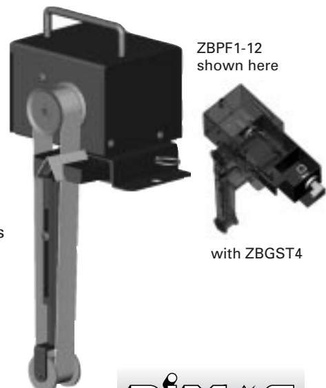
ZBPF1-12 shown here

Replacement parts and prices available, call.